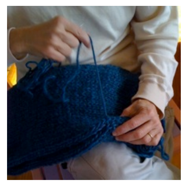
Then, with a tapestry needle stitch through all layers at the bottom of the bag.